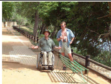
Nkhuhlu River Frontage