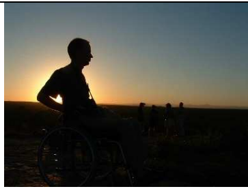
Sundowners - Mathekanyane Hill Top