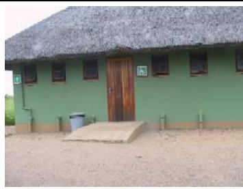
Erosion at Babalala Ablutions Ramp