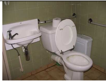
Nkuhlu Tea Room Accessible Toilet