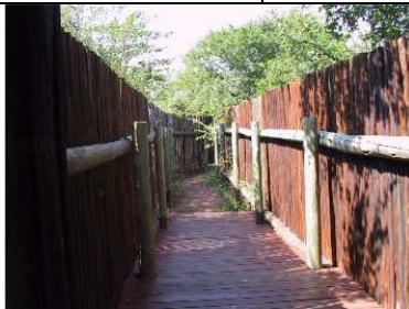
Pioneer Dam Hide