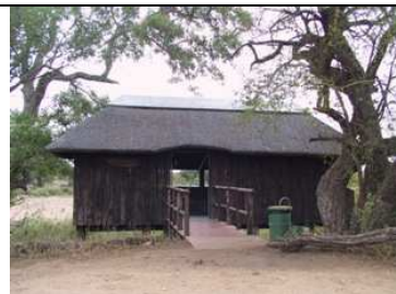
Ratel Pan Hide