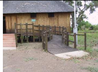
Access Ramp into Makhadzi Museum