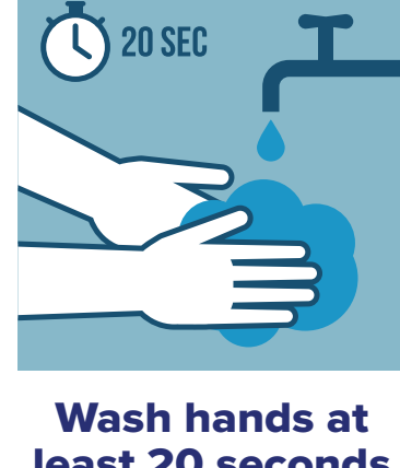
least 20 seconds