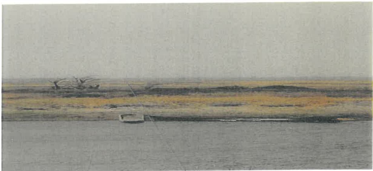
Figure 2: Tributary from the main Linyanti river

4.4.4 In addition, following the establishment of the communal conservancy in Dzoti, hunting concession hunted hippos in these islands such as Dzoti and other islands in Namibia, but as of 2010, these activities could not be undertaken as they were refused entry into the islands by the BDF members. According to witnesses that presented to the committee, the Namibian government should take the Botswana government to court for invading Namibian land illegally. The committee visited one of the islands to familiarize itself with some of the mentioned islands. One of such islands was Mbara situated along the Linyanti river Malengalenga/ Mbilanjwe areas. A cattle post together with a traditional dwelling were observed in the island and a tributary from the main Linyanti river, where the BDF camps were located at the side of Botswana. At the tributary, it is where the BDF claims is the border with Namibia, and that the cattle post observed to be the other side of the tributary is in Botswana. According to witnesses, the owner of the cattle post was informed to vacate by the BDF, as he was in Botswana illegally. The picture bellow illustrates a tributary from the main Linyanti river and the cattle post belonging to the Namibian resident called Mr Mashazi.