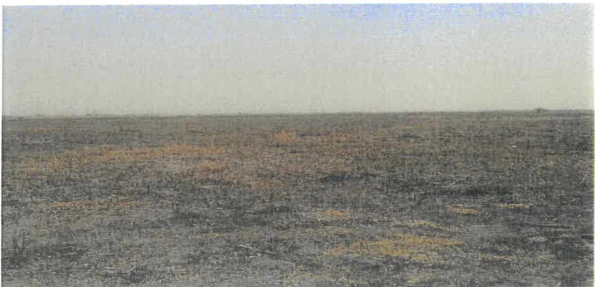
Figure 3: A burnt grassland pasture by BDF members