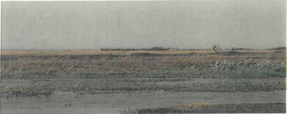
Cattle post belonging to a Namibian resident across the tributary.