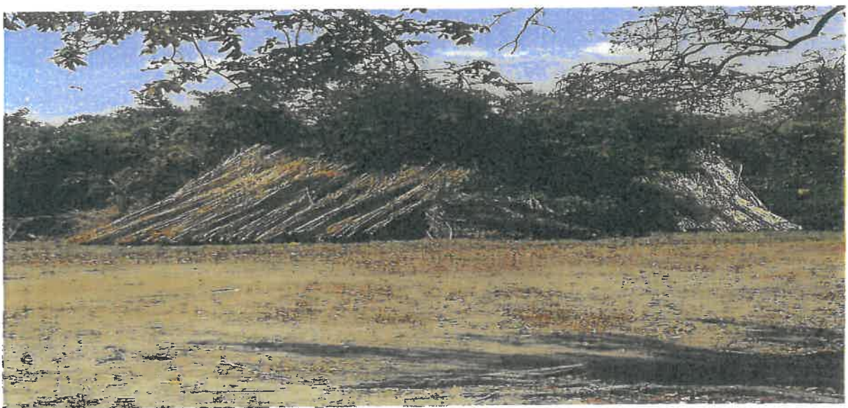
Figure 1: Water Reeds From Rivers

4.2.3 The form of life these riverine people led before independence, and just after Namibia attained its independence, has become something that was only possible in the past.